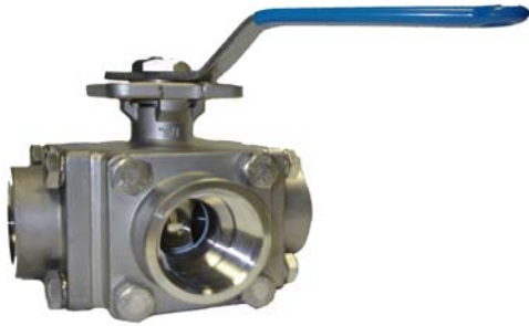
Fig No: B924 L/T Reduced Bore 1/2"~ 4" DN15 ~ DN100